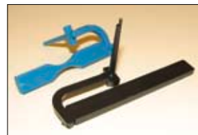
80mm test bar and 60mm short tensile bar